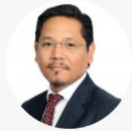
Conrad Sangma Chief Minister, Meghalaya