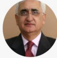
Salman Khurshid Senior Advocate, former Minister, Supreme Court of India