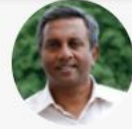
Salil Shetty Vice President, Global Programs, Open Society Foundations