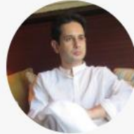
Pradyot Manikya Chairman, The Indigenous Progressive Regional Alliance, Tripura